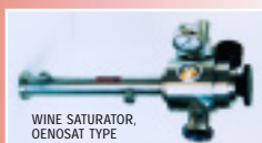
WINE SATURATOR, OENOSAT TYPE